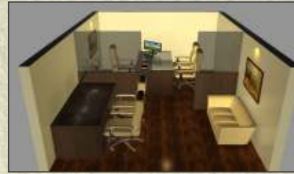
Professional Offices Space offered: 150 sq ft