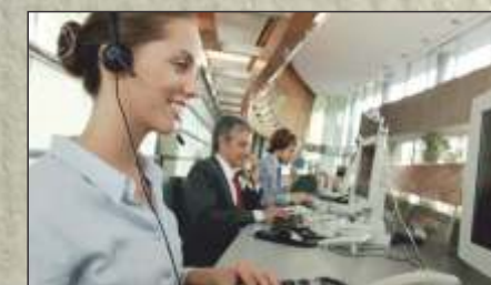
Virtual Space Space offered: 500 sq ft & multiples