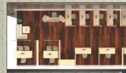
Custom Designed Offices Spaces offered: 500-2000 sq ft