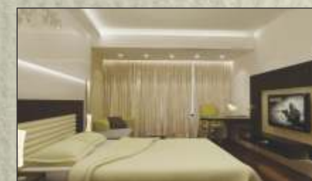
Service Studios Spaces offered: 490-730 sq ft