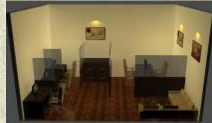
Corporate Studio Space offered: 300 sq ft